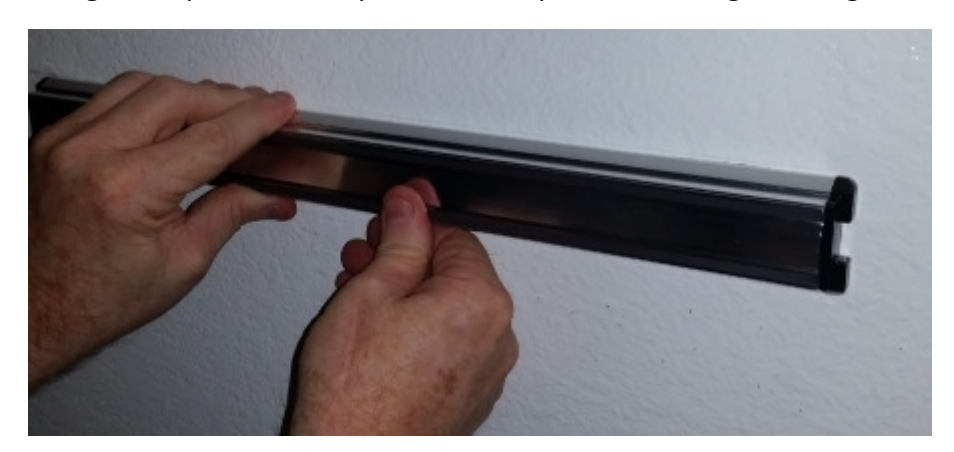
Magnetic Organizer after it has been snapped into the End Caps

Using some pressure, snap the bottom part of the Magnetic Organizer into the bottom of the End Caps